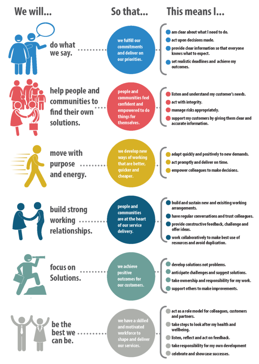
Figure 2 Warwickshire's Six Key Behaviours