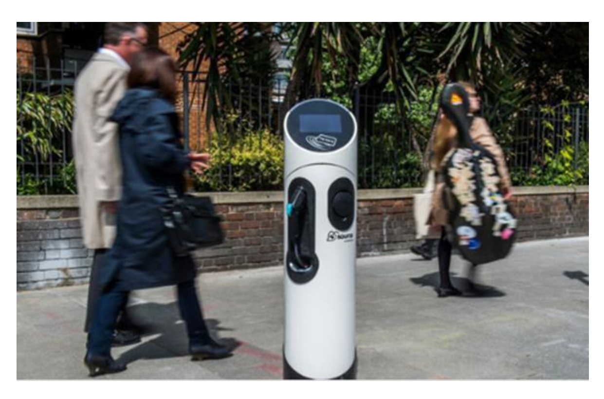
'Warwickshire - Leading the Charge'