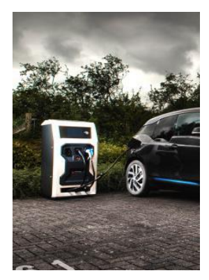
3kW charging point