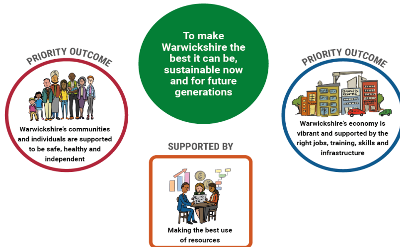
Figure 2: The Council's Core Purpose and Priority Outcomes

The Annual Governance Statement provides assurances that these processes are working in practice and provide services in line with our priorities by delivering on our supporting priority of Making the Best Use of Resources.