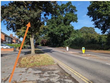
Tree to be removed. Looking west towards Leamington