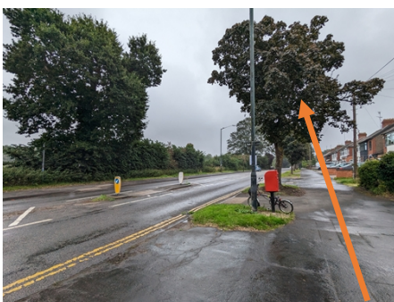
Looking east towards Radford Semele.

The removal of the tree is considered necessary: