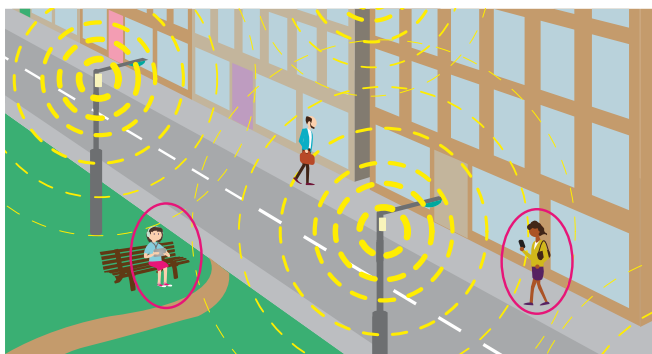
Figure B: Small cell deployment in a city centre

However, a significant increase in the number of small cells is not expected immediately as operators are concentrating on adding 5G technology to their existing sites.