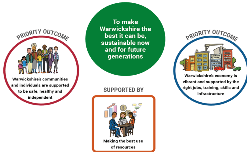
Figure 2: The Council's Core Purpose and Priority Outcomes

The Annual Governance Statement provides assurances that these processes are working in practice and provide services in line with our priorities by delivering on our supporting priority of Making the Best Use of Resources.